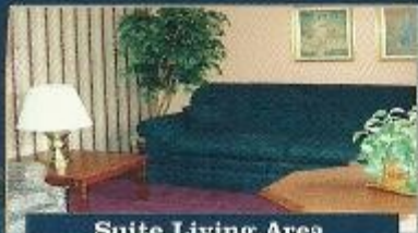
Suite Living Area