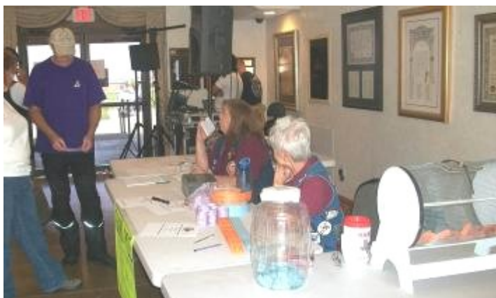
Will that be cash or a check?