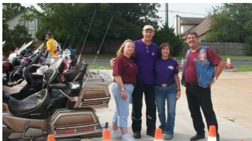
Friends for fun!