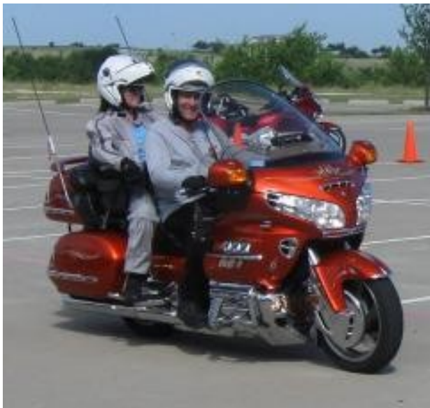
All the gear, all the time!

Aaaawwee, October. Can you feel it? Fall has finally made its way to North Texas! I gotta believe it is the best season of the year! Can I get a witness? You bet I can.