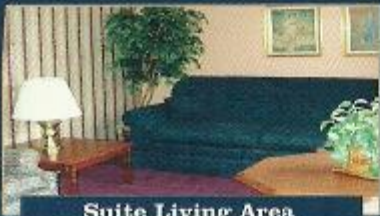
Suite Living Area