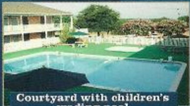
Courtyard with children's wading pool