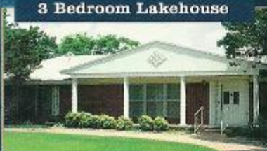
3 Bedroom Lakehouse