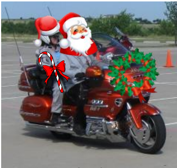
Here comes Santa Clause

T'was just weeks before Christmas, and stuck in the house, In front of the computer, with my hand on the mouse.