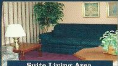
Suite Living Area