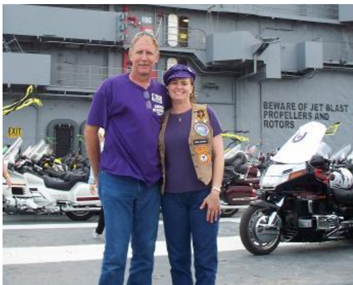
Photo taken aboard the carrier Lexington in Corpus Christie. Site of the Texas District Rally 2008