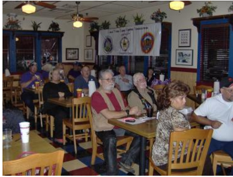
Chapter participants urgent for the 50/50 ticket to be drawn