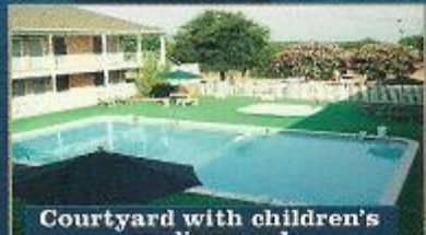
Courtyard with children's wading pool