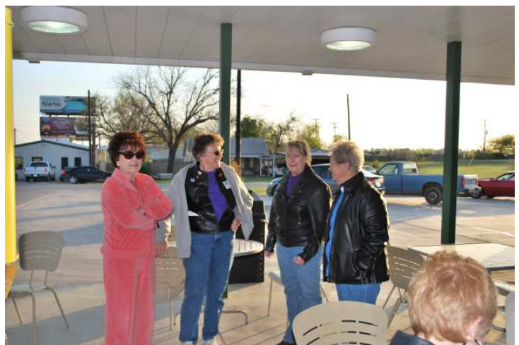
Sonic drive in on 3-26. Chapter P ladies

The weather was great and many attended this monthly chapter function.